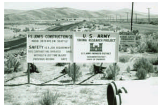
(U//FOUO) YRS Construction Site, July 1971.

(S//SI//REL) Several locations were considered in addition to the site eventually selected on the Yakima Firing Center (later renamed Yakima Training Center) in south central Washington. Alternate locations were near the town of Yelm, Washington, rejected because of anticipated electromagnetic radio frequency interference (EMI/RFI) from the proposed SAFEGUARD antiballistic missile system to be installed nearby, and near Stevenson, Washington, free of radio interference, but too far from sizeable population centers to support the assigned workforce. The fourth potential site was near Oakridge, Oregon