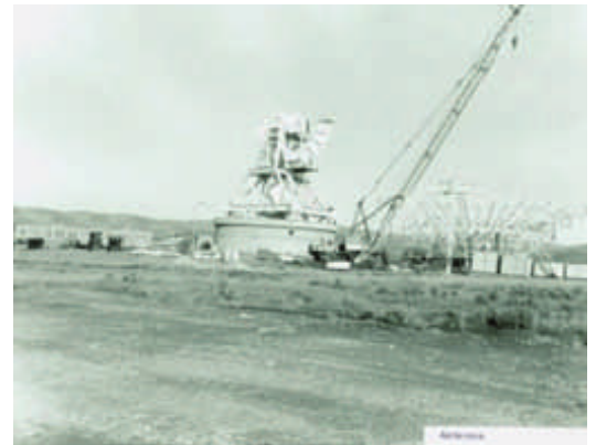
(U//FOUO) 30-Meter Antenna Installation.