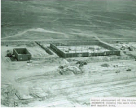
(U//FOUO) Aerial view of Project JACKKNIFE, showing the main and support buildings under construction, May 1972

(S//SI//REL) In addition to the major components above, the JACKKNIFE mission was augmented with a voice collection effort consisting of 16 audio records. The original collection, analysis, and processing configuration also included an analysis subsystem known as STEAMS (System Test, Evaluation, Analysis, and Monitoring Subsystem). This collection system and the missions tasked to YRS would see tremendous changes over the next few years.