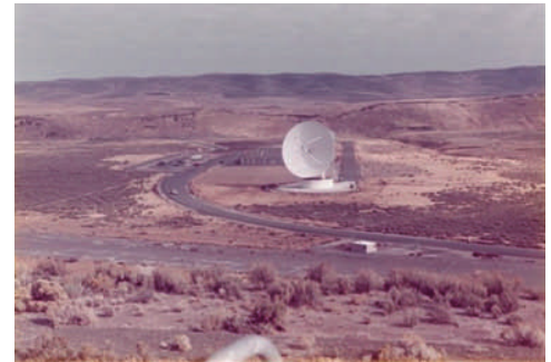
(U//FOUO) YRS with its very first antenna. - a 30-meter parabolic feed. JAM still stands today.

(S//SI//REL) In addition to the major components above, the JACKKNIFE mission was augmented with a voice collection effort consisting of 16 audio records. The original collection, analysis, and processing configuration also included an analysis subsystem known as STEAMS (System Test, Evaluation, Analysis, and Monitoring Subsystem). This collection system and the missions tasked to YRS would see tremendous changes over the next few years.