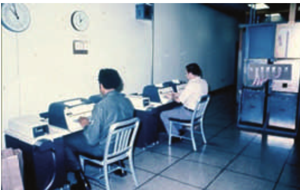
(U//FOUO) YRS Operators in the Early Days.